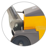
Articulation of the handle