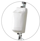
Tank 9 l (optional)