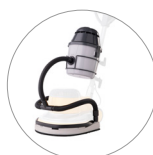
Suction kit (optional)