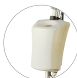
Tank 12 l (optional)