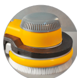
Extra weight (optional)