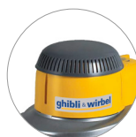
New plastic cover (L22)