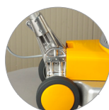
Articulation of the handle