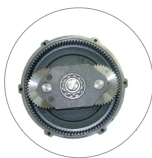
Planetary gear (L22)