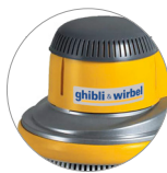
New plastic cover (L22)