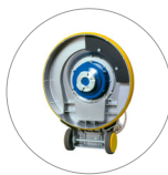
Mount for drive board and brushes