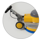
Articulation of the handle