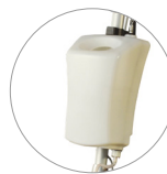
Tank 12 l (optional)