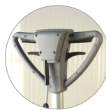
Handle (rear view)