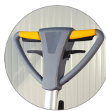
Ergonomic Handle (front view)