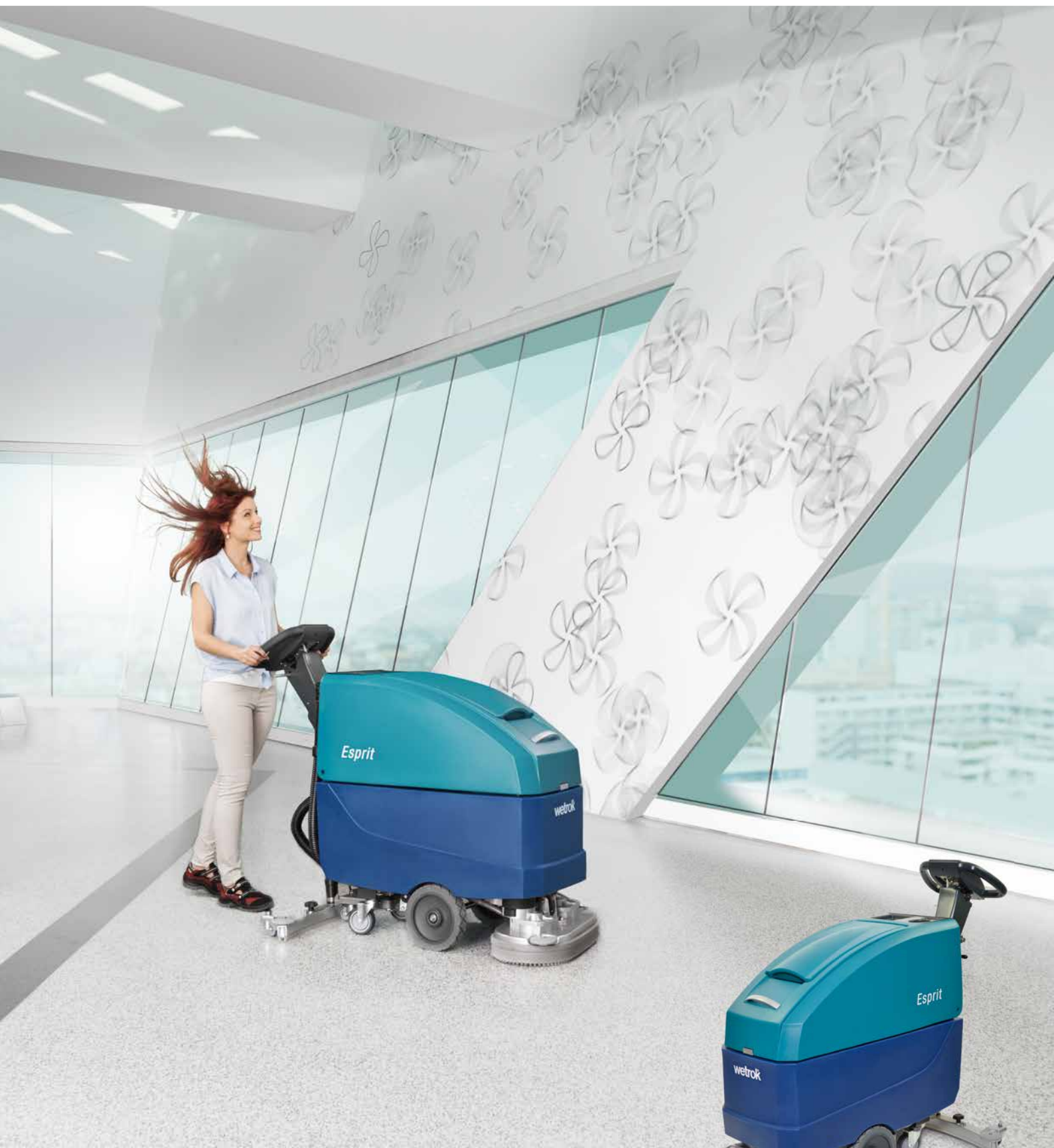
Duomatic Esprit With Power-Whirl for maintenance cleaning