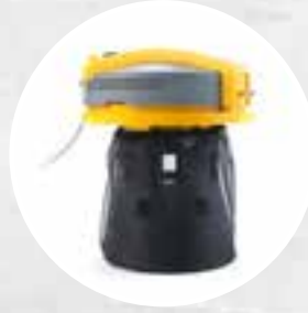
NYLON PROTECTION FILTER