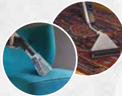
IDEAL FOR EVERY TYPE OF TEXTILE SURFACE

Each model can be even more customized thanks to a wide selection of optional accessories. The Power Extra 7 model also features the "P" version, characterized by the resistant polypropylene tank.