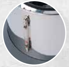
CLEAN WATER LEVEL INDICATOR