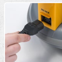
SOCKET FOR POWER BRUSH