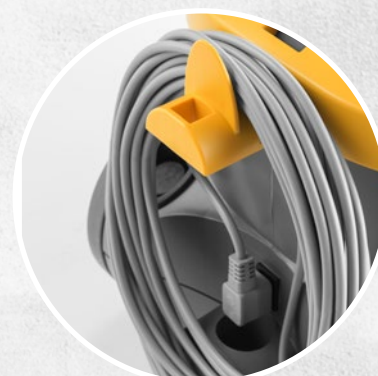
DETACHABLE CABLE 15 M (ON STANDARD EQUIPMENT)

TRIPLE FILTERING SYSTEM PAPER FILTER BAG + TEXTILE OR CARTRIDGE FILTER + EXHAUST AIR FILTER