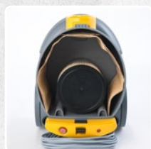
INSIDE CONTAINER OF GREAT DIMENSIONS