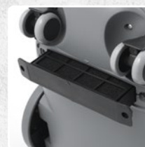
EXHAUST AIR FILTER