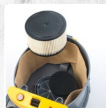
MOTOR PROTECTION FILTER + HEPA CARTRIDGE FILTER