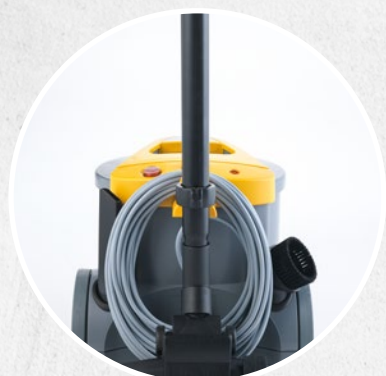
NEW FIXING SYSTEM