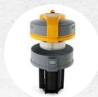
Ultra FilteRing System