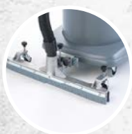
Gangway tool (optional)