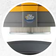
PTFE cartridge filter M filtration class