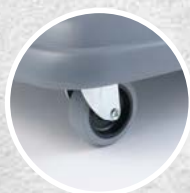
Front swivel castor wheels