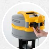
Inlet and outlet of the motor cooling air