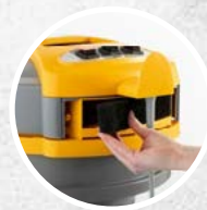
Exhaust air filter