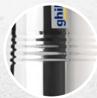
Stainless steel container sturdy and durable