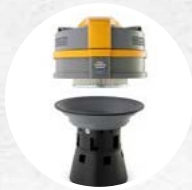
Ultra FilteRing System