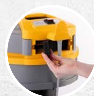
Exhaust air filter