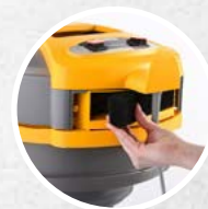
Exhaust air filter