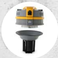
Ultra FilteRing System