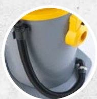
Drain hose to empty the container from liquids (PD).